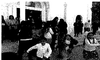
Mass is over at the Church of the Redeemer in Taybeh in Palestine